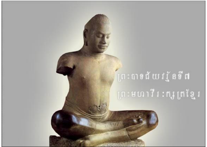
King Jayavarman VII

The Cambodian Centre for Applied Philosophy and Ethics envisions a just, peaceful and sustainable society in which people live with full dignity and wisdom.