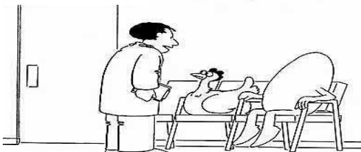
"who was first?"

The Cambodian Centre for Applied Philosophy and Ethics “CAMCAPE” is an independent non-political and non-profit organization which has been established by a group of Cambodian scholars in November 2006 and registered with the Ministry of Interior of Cambodia on 19 th June 2007. CAMCAPE is an educational, researching, advocating and consulting organization which functions as a “Think Tank” to bring essential philosophical reflection and ethical thoughts to many areas of Cambodia’s socio-economic and spiritual development.